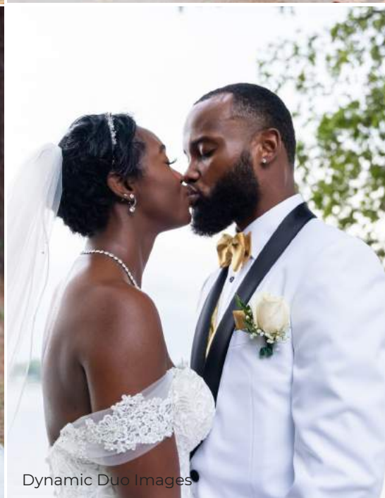
Dynamic Duo Images