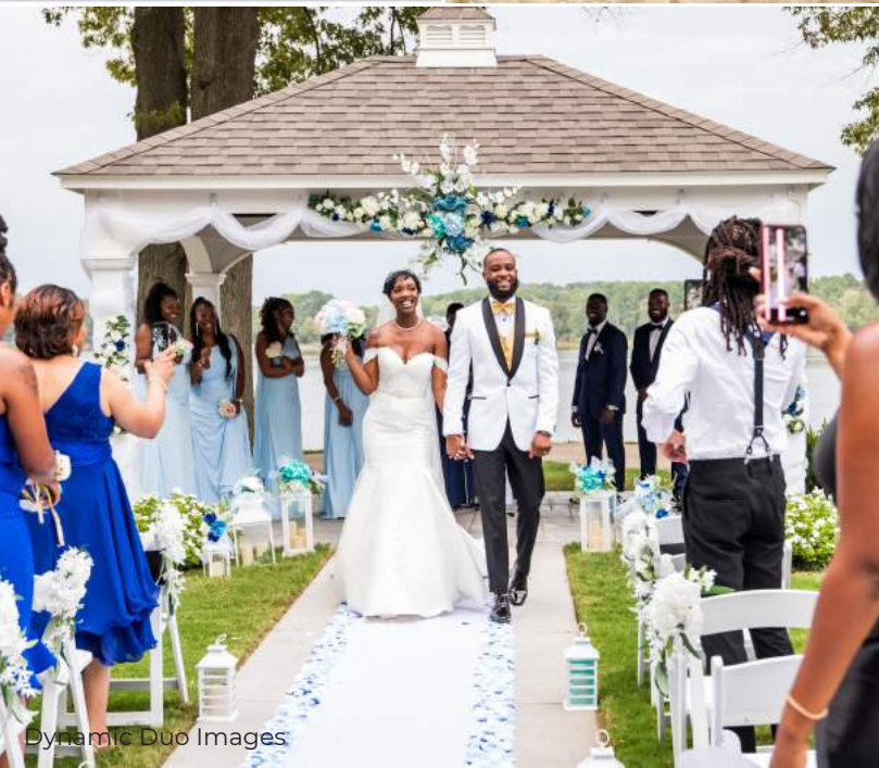
Dynamic Duo Images